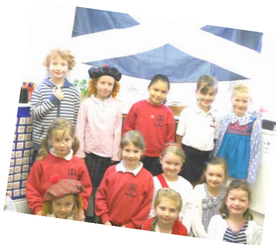
Forms Larch, Ash and Oak H [pictured] learning about Norway, Scotland and Switzerland.